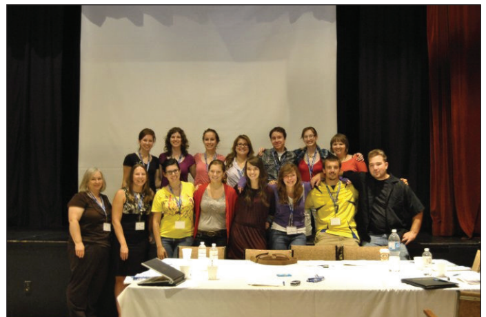
CYMK seminar at St. Vladimir's Theatre.