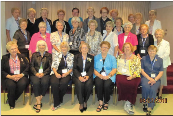
Ukrainian Women's Association of Canada (UWAC). See Pg. 1 & 4.