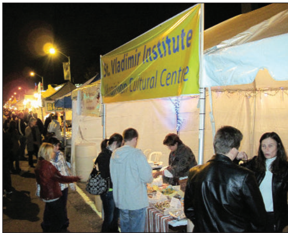
Bloor West Village Festival on Friday night.